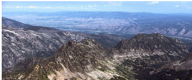
(Picture of the Bitterroot Valley retrieved from Wikipedia.com, http://en.wikipedia.org/wiki/Bitterroot_Valley )